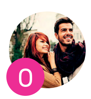
Singles and Starters